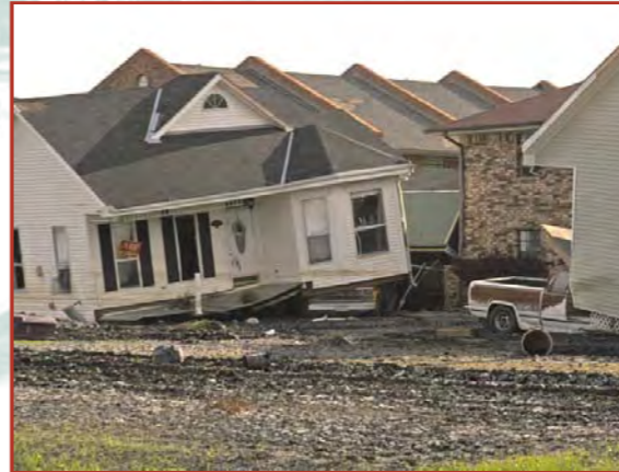
Homes pushed off their foundations after the levees broke.