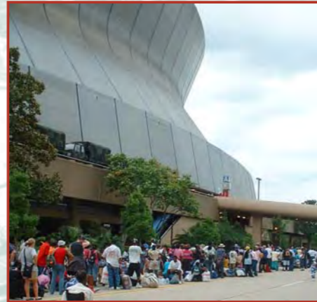
In advance of Hurricane Katrina, New Orleans residents line up to take shelter in the Superdome (photo: Marty Bahamonde/FEMA ).

THEME: HURRICANE KATRINA—LESSONS FOR EARTHQUAKE RISK REDUCTION